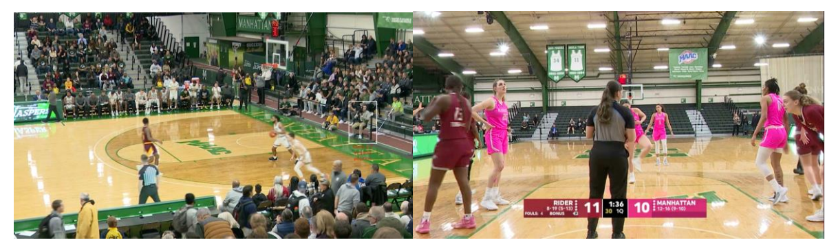
Figures 4 and 5. Camera 3 Position and Shot

Weeks 1, 4 and 9 place the student under and behind a basket to shoot two minutes of practice footage; this replicates cameras 3 and 4 (see Figure 4 for the position and Figure 5 for the shot). This is the most difficult camera position, since students are very close to the action and it is easy to lose sight of the action.