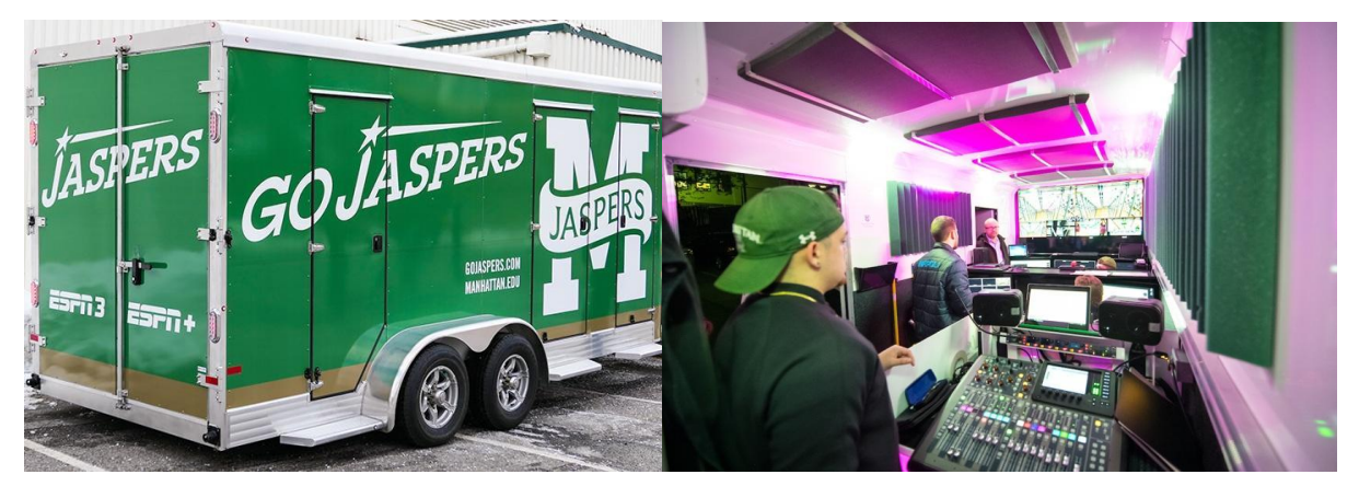
Figures 1 and 2. Manhattan College ESPN Mobile Production Unit

case of Manhattan College (and other MAAC schools) this is a Mobile Production Unit, or MPU. The fourstudent camera crew works in the arena, either extremely close to the court, or on an elevator lift high above it, while the remaining four students work in the MPU immediately adjacent to the arena. The student crew is managed by a professor who interfaces with ESPN, functions as producer/director of the production, and teaches the Advanced classes.